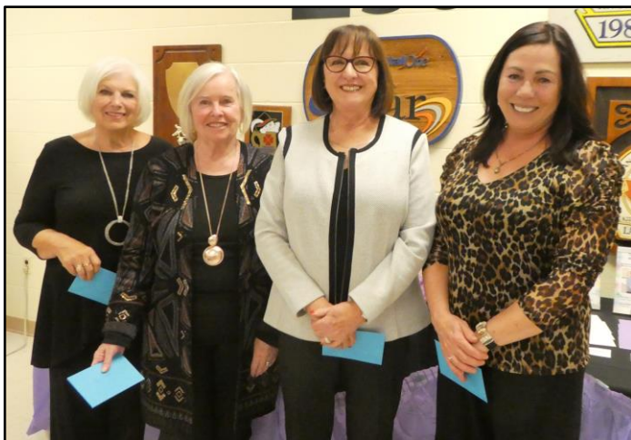
Not only did Team Rotar win some prize money, but they also claimed the award for best-dressed team at the closing banquet!