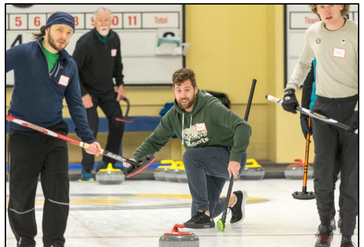
A delivery with style and a smile at the Dec. 2023 Cinco Spiel